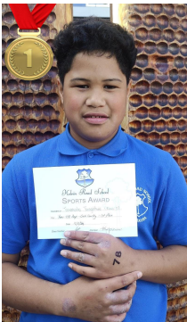
Tumanako 1st -Tau 7/8