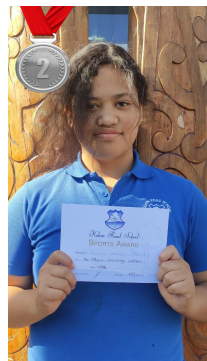
Tawhiri 2nd -Tau 7/8