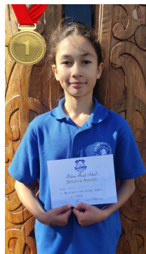
Naria 1st -Tau 6