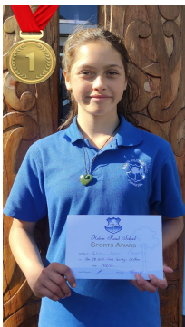
Chleo 1st -Tau 7/8