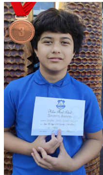
Kingston 3rd -Tau 7/8