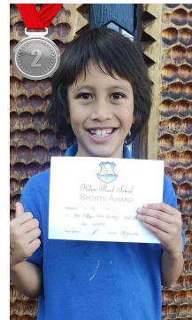
TūAke 2nd -Tau 3